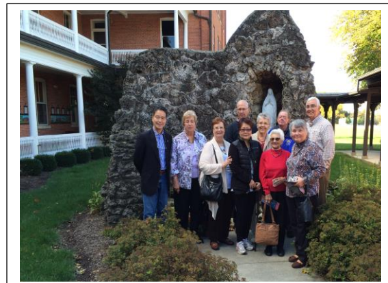
Some of those in attendance