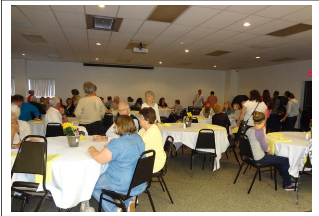
The hall quickly filled at tables getting ready for the great meal.