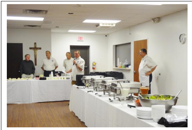
The serving line all ready to go...