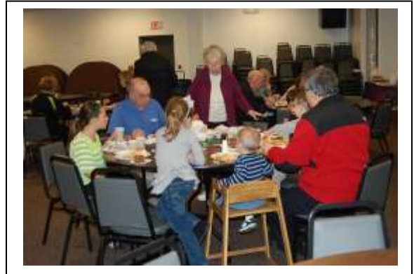
Yes, it was a great Avila family dinner!