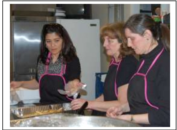
St Mary volunteers working in the kitchen