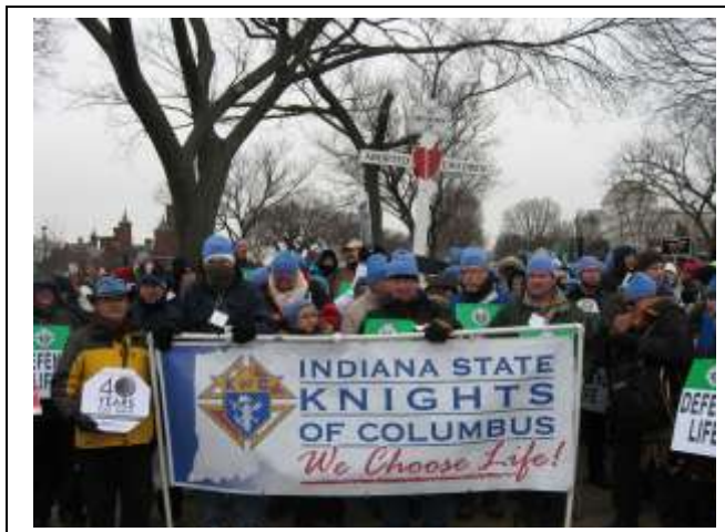
Photo above: The Indiana Knights of Columbus ready to participate in the March for Life in Washington, DC.