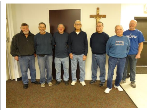
Some of the knights that did the setup for the banquet. Thank you for all your good work!

Photos follow for a snapshot overview of the event: