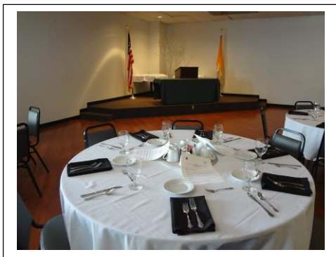
A finished table showing the podium in the back.