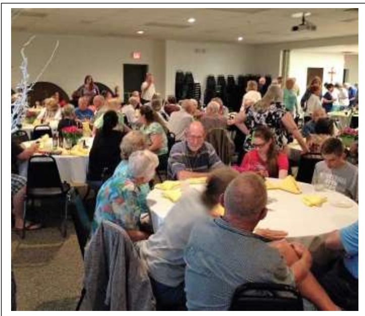
The event was well attended...