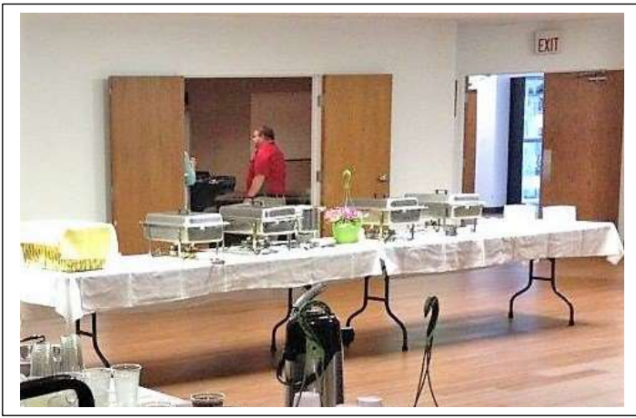
The buffet table with the wonderful dinner almost ready.