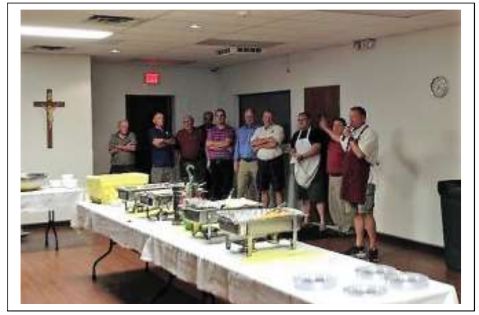
Introducing the kitchen crew. Good work knights!