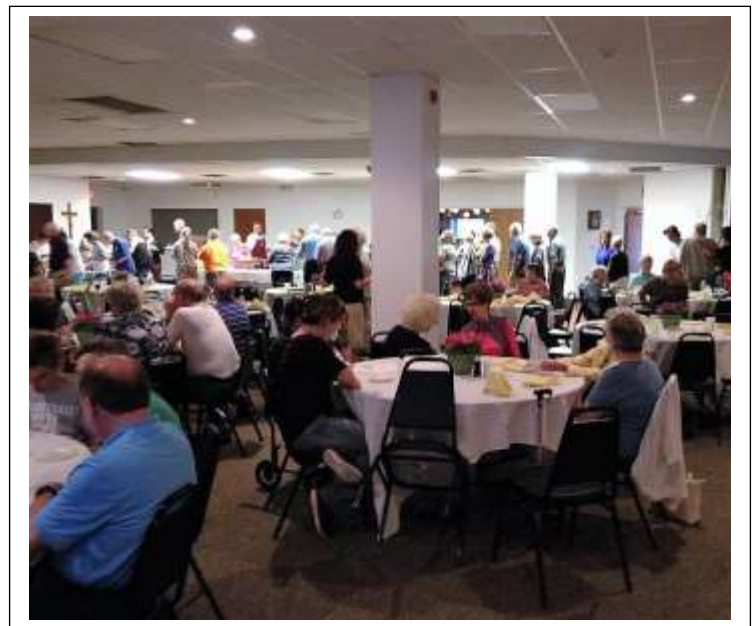
...and enjoyed by everyone!