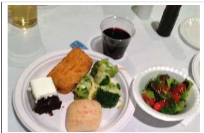
What a wonderful dinner was served to all attending.