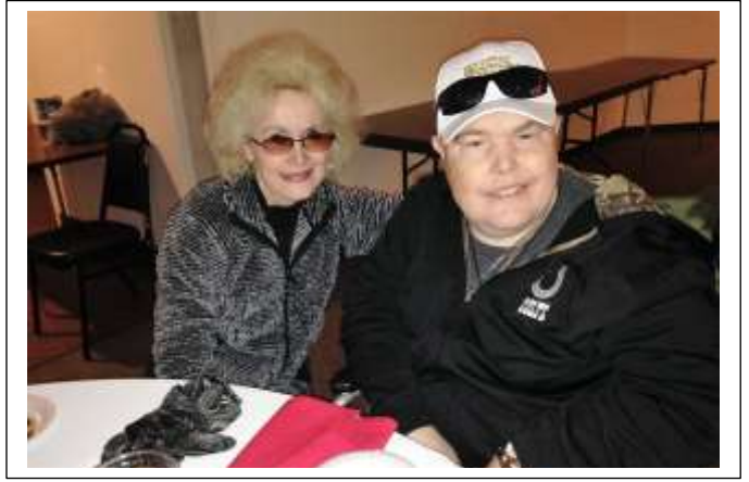
The Geisler family attended for some food and fun.