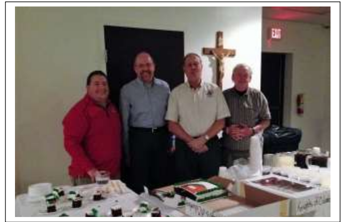
Knights ready at the dessert table.