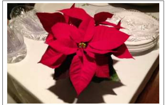
Each table had a beautiful poinsettia center piece.