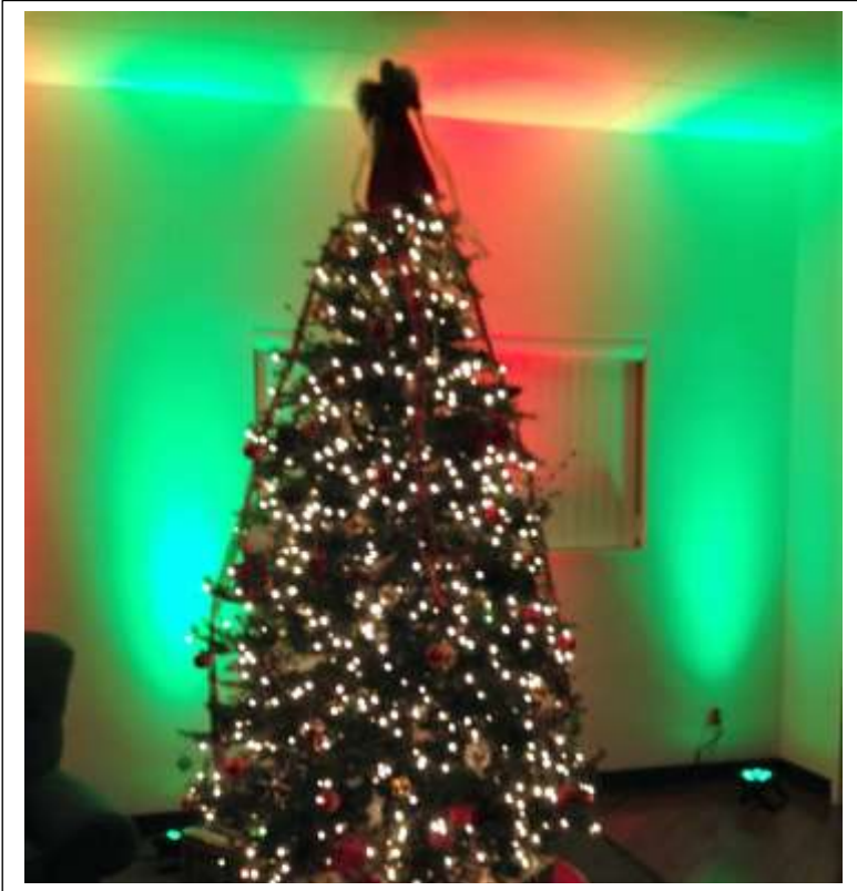
The Hall was beautifully decorated...

Some photos of the event provide a visual glimpse of all the fun: