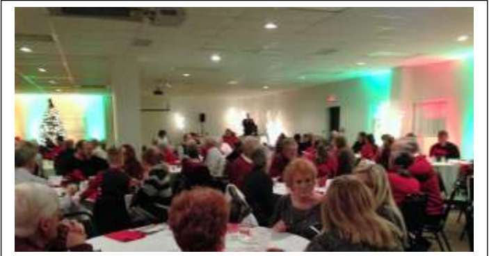
The Christmas Party was well attended.