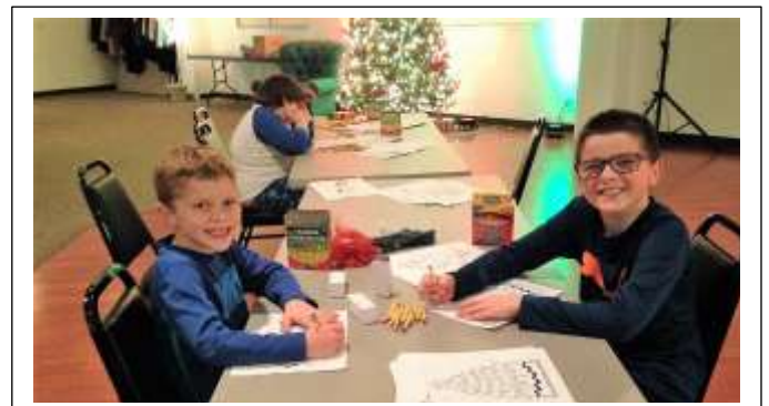
The children liked their special activity table.