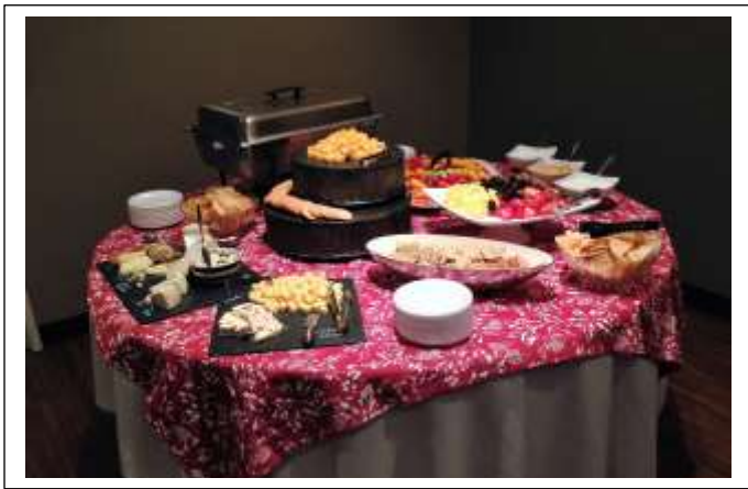
The appetizer table by VKA Kitchen and Catering.