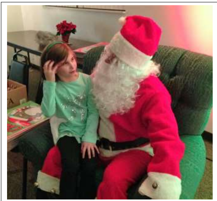
Santa was a hit with the children.